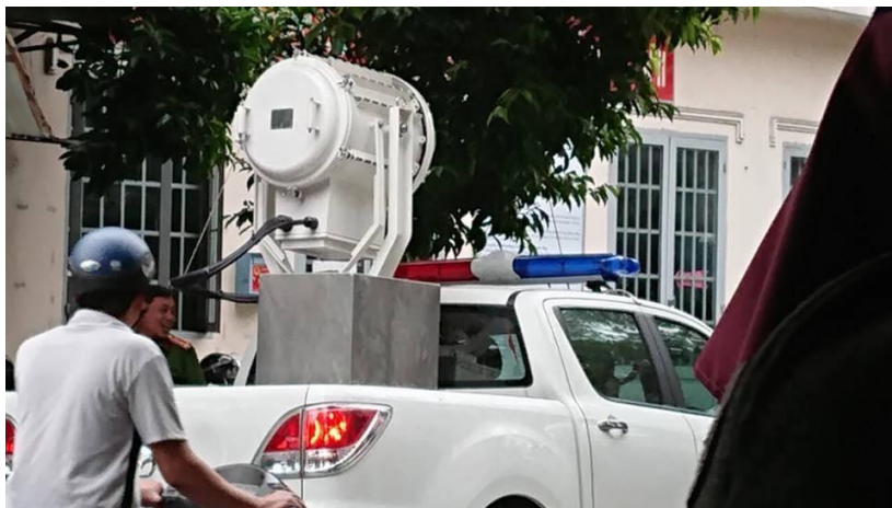
Img. 4 Activists suspect that LRADs were used against protesters.

People in Phan Ri Cua, a small town in the coastal province of Binh Thuan, were also among those who suffered the most from police brutality. A young fisher was so seriously beaten in police custody that he went into coma on June 20. Several others were jailed and charged with “causing public disorder.” At the same time, all of the local protesters were defamed by mainstream media, who alleged that they were paid 300,000 VND by “hostile forces” to join the demonstrations but did not go into details as to who the hostile forces were.