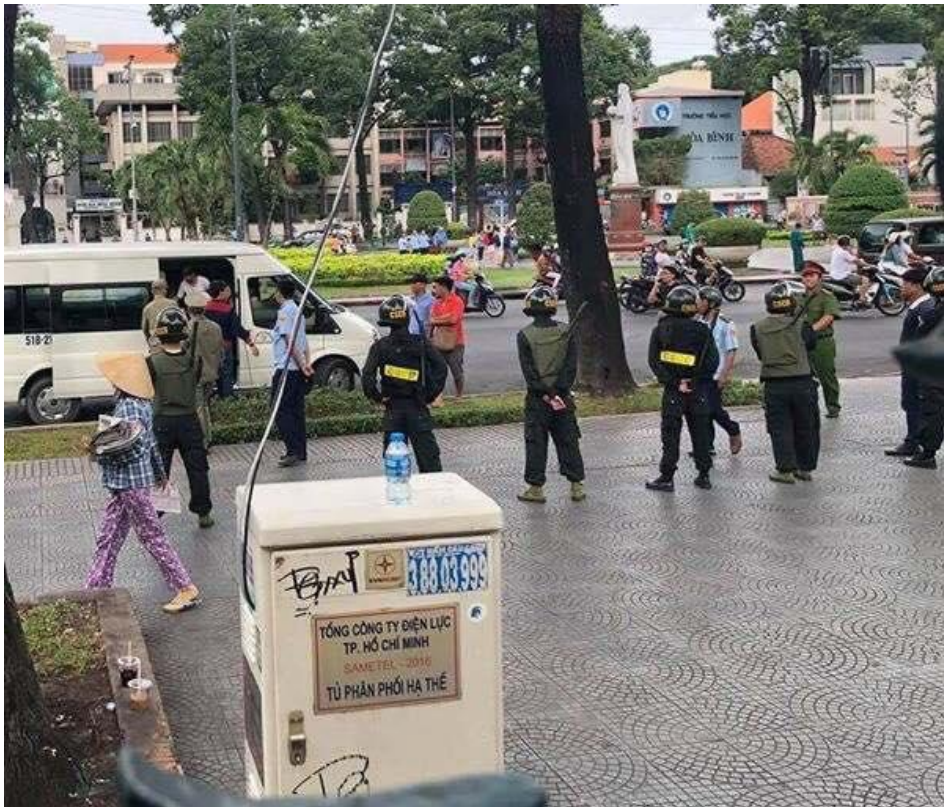
Img. 5 HCMC was surrounded by hundreds of police on June 17.

Starting in the early morning of June 17, downtown HCMC was surrounded by hundreds of uniformed and plainclothes police. In a pre-emptive strike against the protestors, the HCMC authorities set up barbed wires around various locations, such as near the Notre Dame Cathedral, Nguyen Hue walking district, and near Hoang Van Thu Park, which are believed to be hotspots for demonstrations.